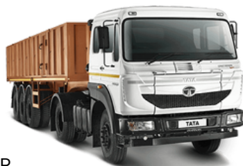
SIDE BODY TRAILER