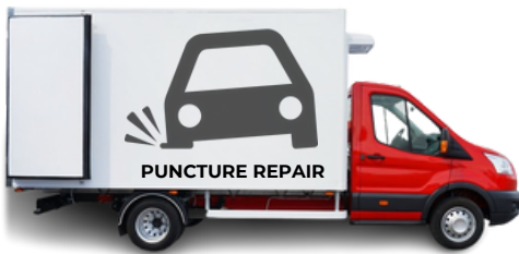
MOBILE PUNCTURE UNIT