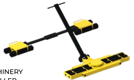
HEAVY MACHINERY SHIFTING ROLLER