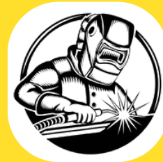
Gas & Elec Welding Work

Safe World Trading and Transport offers equipment's when and where you need them. Our staff of highly skilled, experienced team are available 24/7 to assist you.