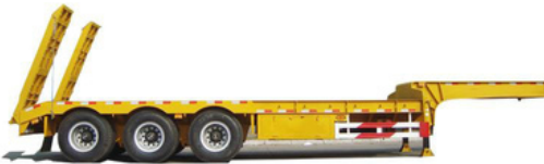
LOW BED TRAILER