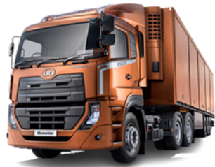
TRUCKS & TRAILERS